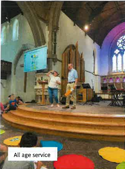
All age service