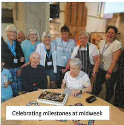
Celebrating milestones at midweek

Over Christmas, we welcomed many hundreds of people through our doors to various special services, including a Service of Light, Christingle, Christmas Praise, Midnight Communion, and traditional Carols by Candlelight. We also held a Longest Night service, which gave time for those who have lost loved ones to remember them. At Easter, we celebrated Good Friday and Easter Sunday with all-age services at church.