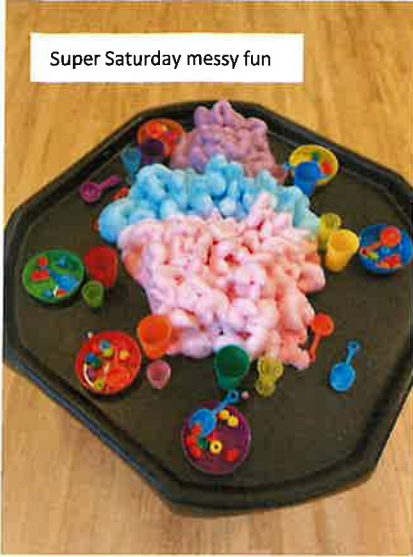
Super Saturday messy fun