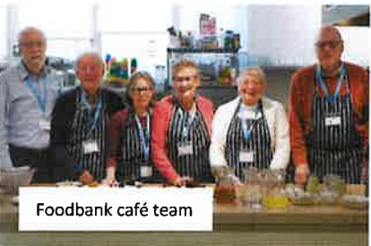
Foodbank café team

Another adds, ‘we love hearing from our ‘regulars’ - those who come because they like the warmth of our welcome - and also those who are new to the Foodbank. We hear about the ups and downs of everyday life, and about the sometimes painful stories of what brings someone to the Foodbank. We listen. We empathise. We encourage. And we share the love of Jesus in any way we can.’