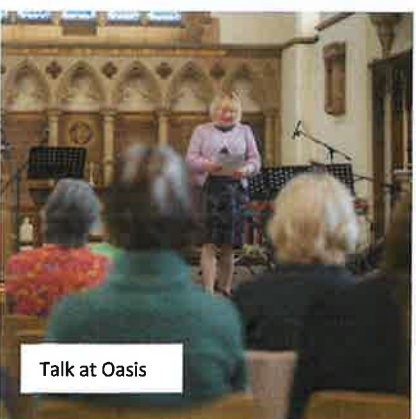
Talk at Oasis