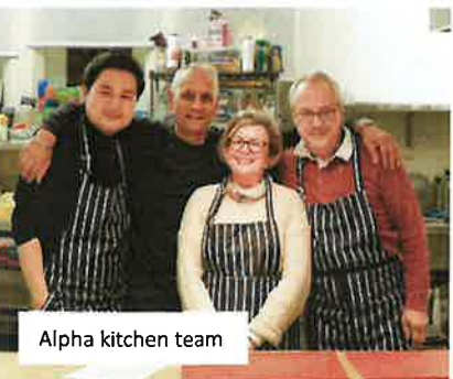
Alpha kitchen team

Prayer continues to be an important part of life at St Paul's. Throughout 2025 we continued to gather at monthly prayer meetings, The Source, to intercede and to make space for hearing God. Prayer is also woven into our regular services, small groups, staff meetings, children's groups and other ministries.