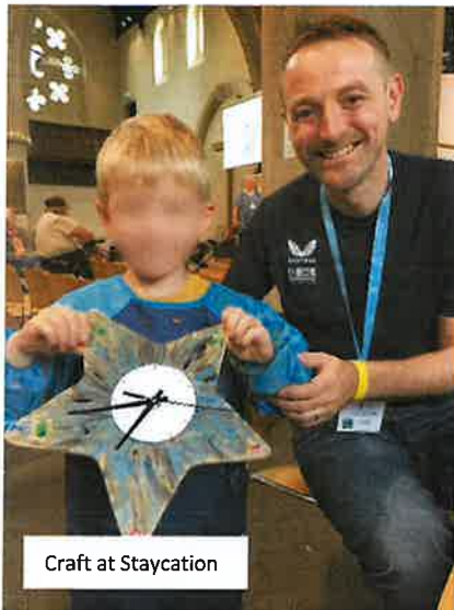
Craft at Staycation