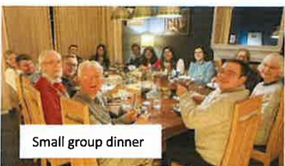
Small group dinner

As attendance continues to grow at all of our services, we encourage everyone that rather than being 'a face in the crowd' you are a valued part of the body of Christ with a vital part to play. A key part of this is being part of a small group - a spiritual 'home' where we can be ourselves, share our lives, grow and learn together and find care and support in tough times.