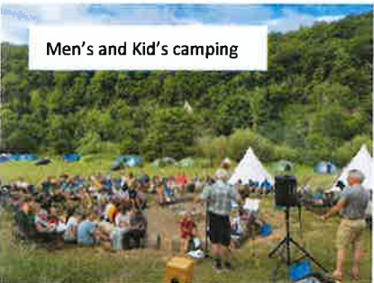
Men's and Kid's camping