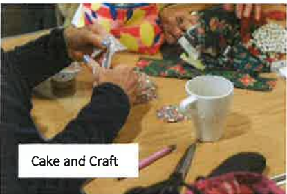
Cake and Craft