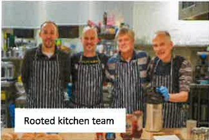
Rooted kitchen team