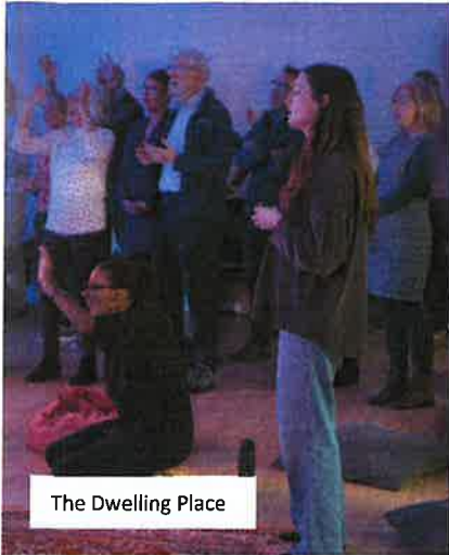
The Dwelling Place

In November we started a new worship night, The Dwelling Place, which will run every other month for the time being. It is a wonderful hour of sung worship and space to be still before the Lord.