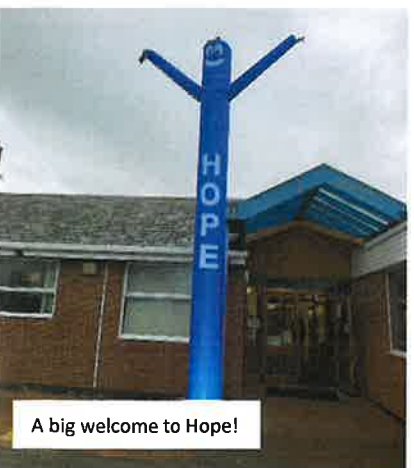
A big welcome to Hope!