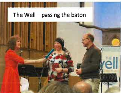
The Well – passing the baton