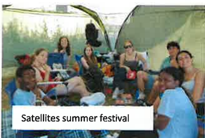
Satellites summer festival

In October, we hosted our annual Light After Party. We invited two young people to share about the difference the light of Jesus has made to their lives. Their powerful testimonies changed the atmosphere for the rest of the night, making it clear that we were gathered to celebrate Jesus.