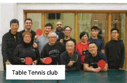
Table Tennis club

feel the call to serve periodically or regularly in a very outward looking, evangelistic, inter-generational, interactive setting.