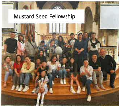
Mustard Seed Fellowship