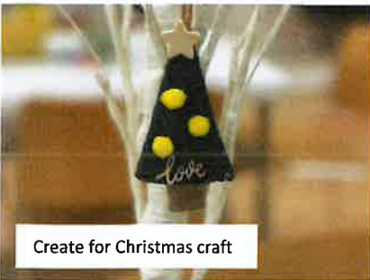
Create for Christmas craft