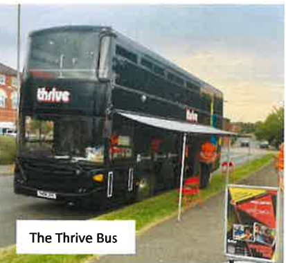
The Thrive Bus